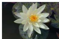
White Pond Lily