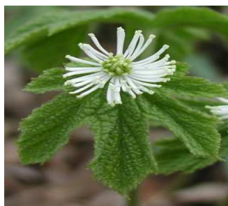
PHOTO OF GOLDENSEAL.

Purchase three bottles (must all be the same product and the same size) of the following IMMUNE SYSTEM BUILDING herbs and receive the 4th bottle free. To take advantage of the special, the three purchased bottles and the FREE bottle must be the same product and purchased at the same time from the list below. Example: purchase three bottles of OLIVE LEAF and receive a fourth bottle of OLIVE LEAF free. No Purchase Volume will be paid on any free bottles.